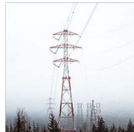
Cables & Wires